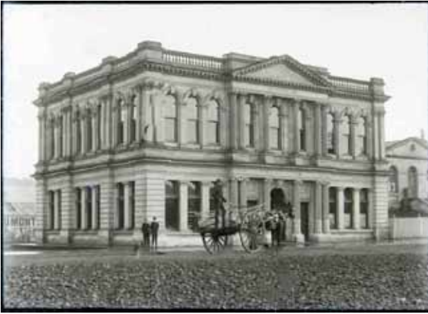
Ōamaru Athenaeum and Mechanics' Institute, Thames Street, mid 1890s. Id 101941

In December 1864 a group was formed to establish an Athenaeum and Mechanic's Institute. In 1865, rooms were rented for this purpose, but closed after only 6 months, as plans were in place to build a bespoke premises that would both house the Athenaeum and have space for lectures to be given. Architectural design for the Athenaeum was completed by Forrester & Lemon, with construction beginning in 1867. By 1879, a larger building was required, and fund raising through bazaars and exhibitions funded the above building (now housing the North Otago Museum). The new building was opened in 1882 with 4000 volumes purchased. Lending of these books began in 1883, and evening classes started in 1887.